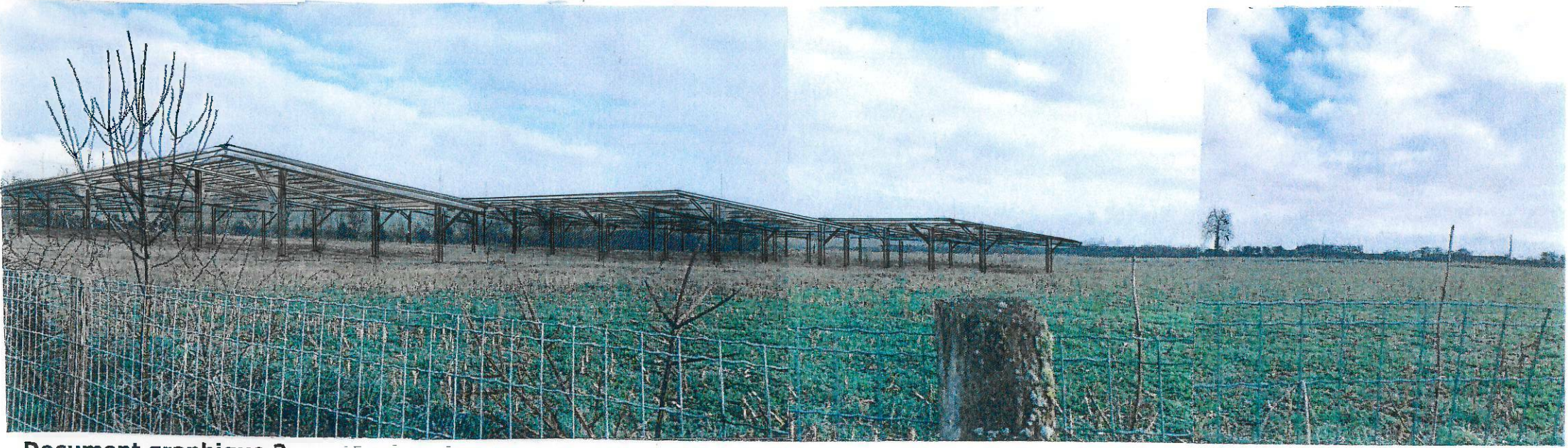
Document graphique 3