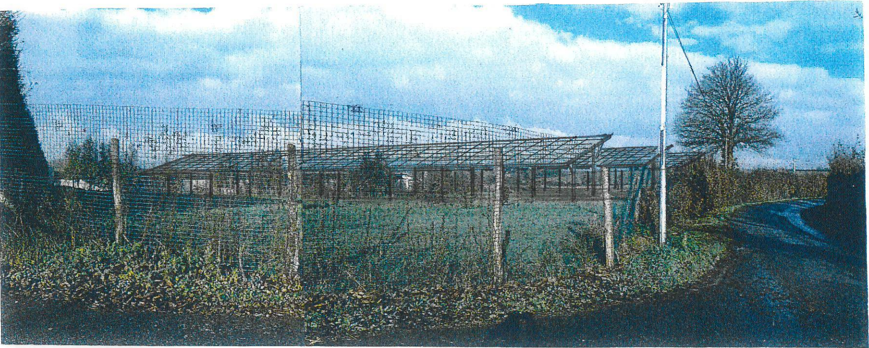
Document graphique 1