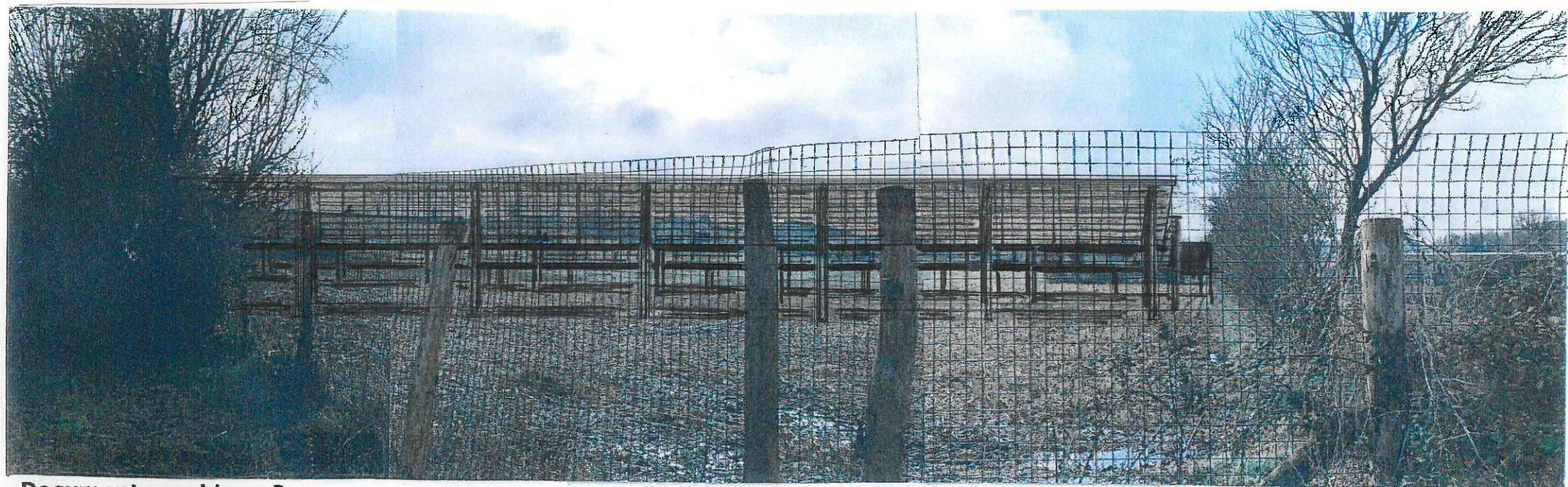
Document graphique 2